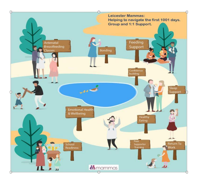
Leicester Mammas – How we help families to navigate the First 1001 Days

Leicester Mammas has been recognised as having expertise and a strong track record in this field, along with a strong commitment to co-production, and we have been invited to contribute to a number of consultations and events on this basis. Whether the momentum is able to be maintained in the current political climate, with the threat of a new era of cuts to essential services, remains to be seen. What is without doubt is the positive impact this has had on Mammas as an organisation, enabling us to grow in confidence and in developing our team.